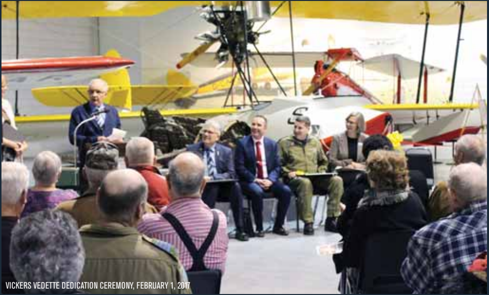
VICKERS VEDETTE DEDICATION CEREMONY, FEBRUARY 1, 2017