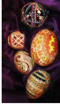
Pysanky from the WDM collection