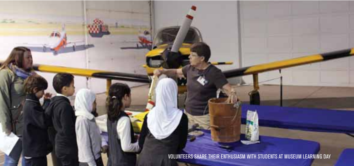
VOLUNTEERS SHARE THEIR ENTHUSIASM WITH STUDENTS AT MUSEUM LEARNING DAY