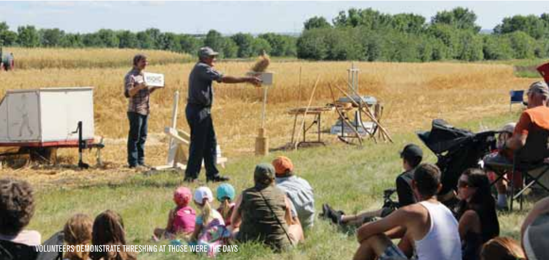
VOLUNTEERS DEMONSTRATE THRESHING AT THOSE WERE THE DAYS