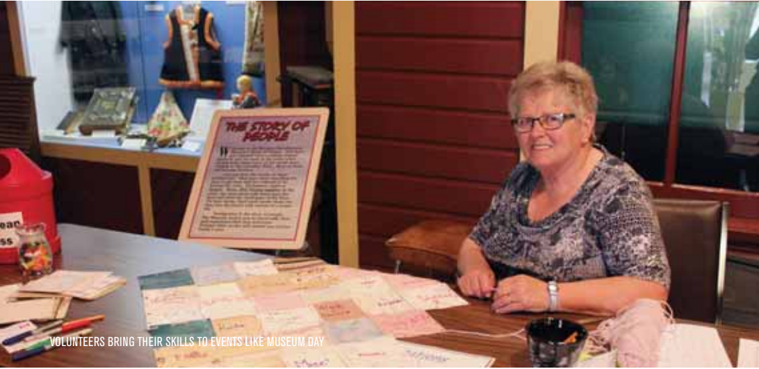
VOLUNTEERS BRING THEIR SKILLS TO EVENTS LIKE MUSEUM DAY