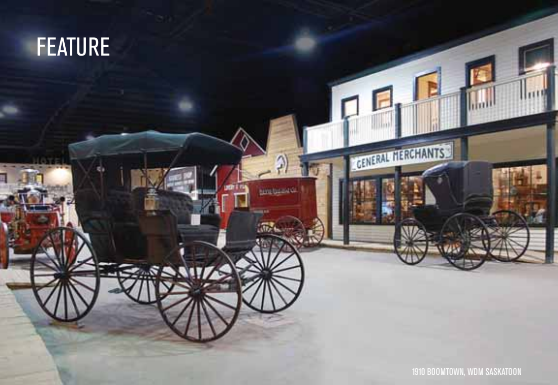
1910 BOOMTOWN, WDM SASKATOON