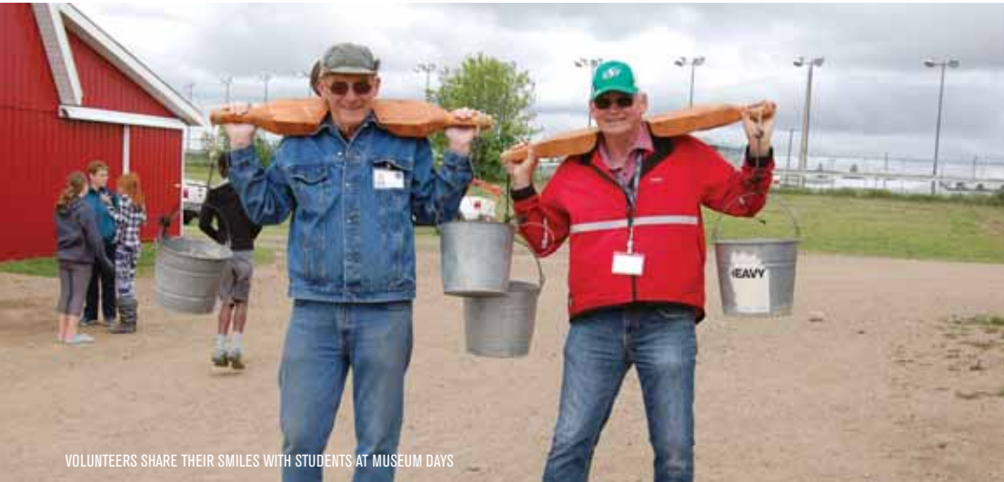
VOLUNTEERS SHARE THEIR SMILES WITH STUDENTS AT MUSEUM DAYS