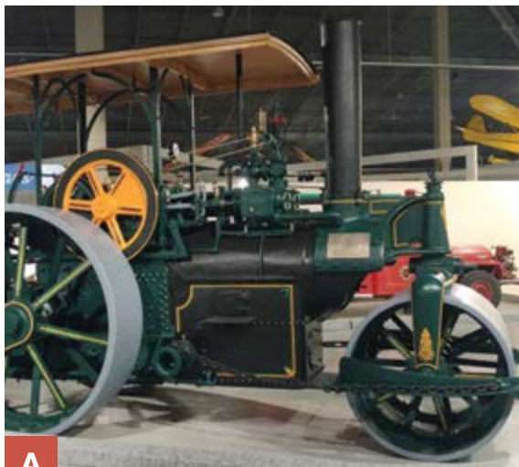
A WDM Moose Jaw – Waterous Road Roller WDM Permanent Exhibit