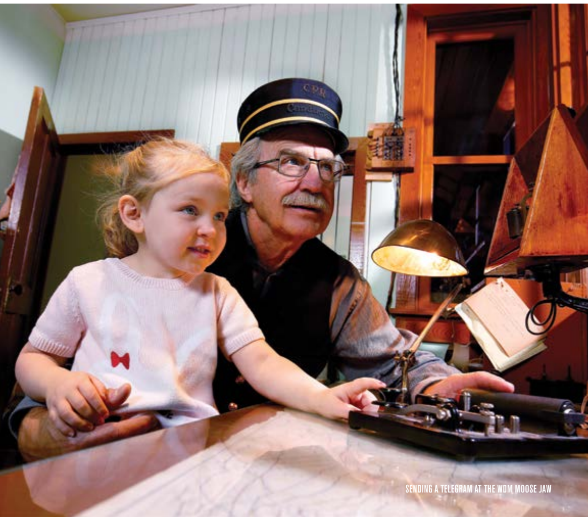
SENDING A TELEGRAM AT THE WDM MOOSE JAW

NEWSLETTER OF THE WESTERN DEVELOPMENT MUSEUM