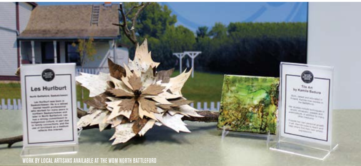
WORK BY LOCAL ARTISANS AVAILABLE AT THE WDM NORTH BATTLEFORD