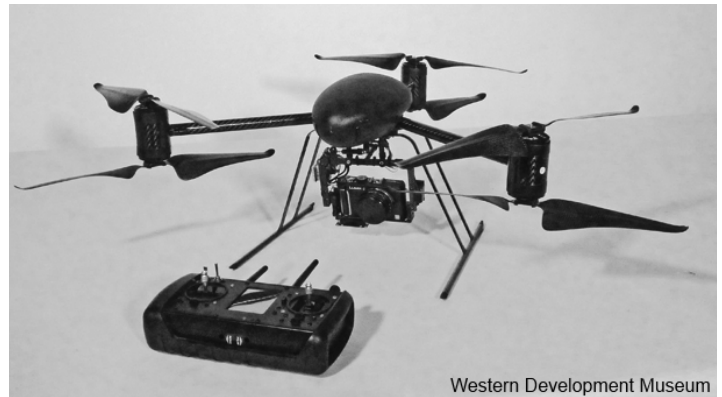
Western Development Museum

Thanks to all of those people, the WDM is having a great year in