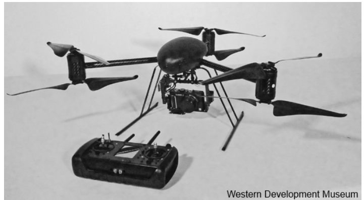
Western Development Museum

Thanks to all of those people, the WDM is having a great year in