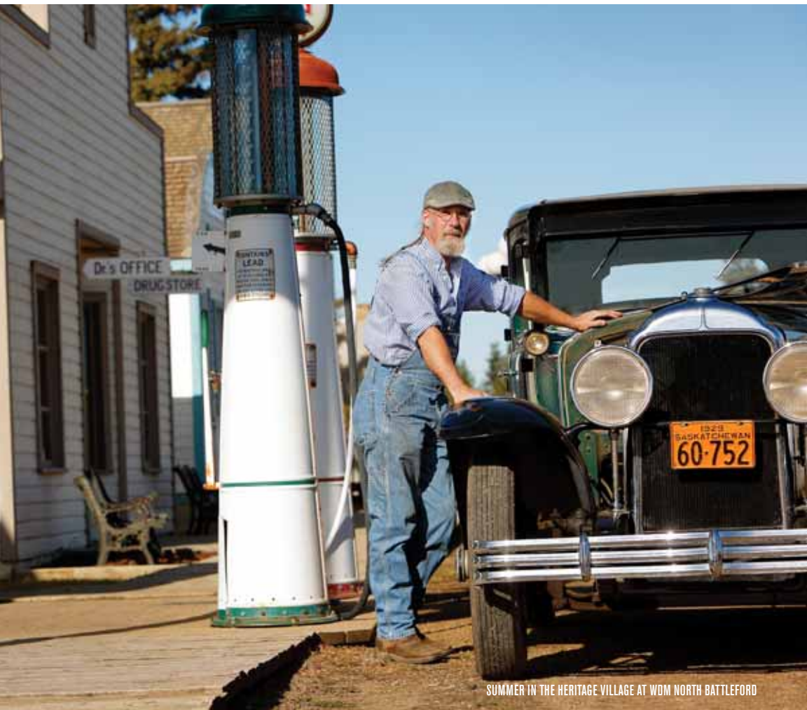
SUMMER IN THE HERITAGE VILLAGE AT WDM NORTH BATTLEFORD

NEWSLETTER OF THE WESTERN DEVELOPMENT MUSEUM