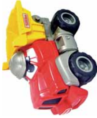
Tonka dump truck by Hasbro Incorporated, 1998 WDM Collection, WDM-2008-S-457