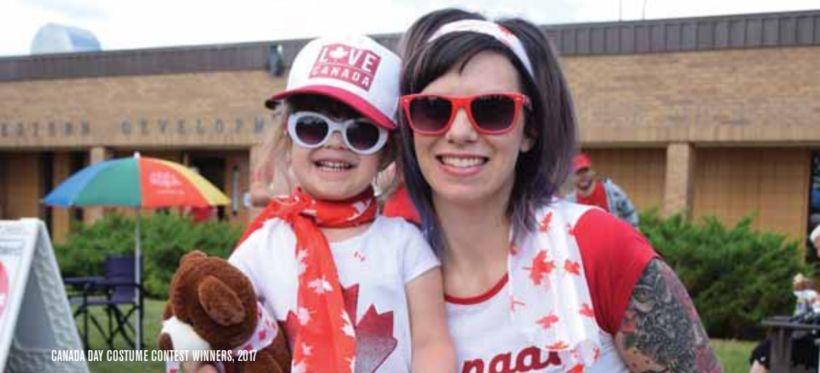
CANADA DAY COSTUME CONTEST WINNERS, 2017