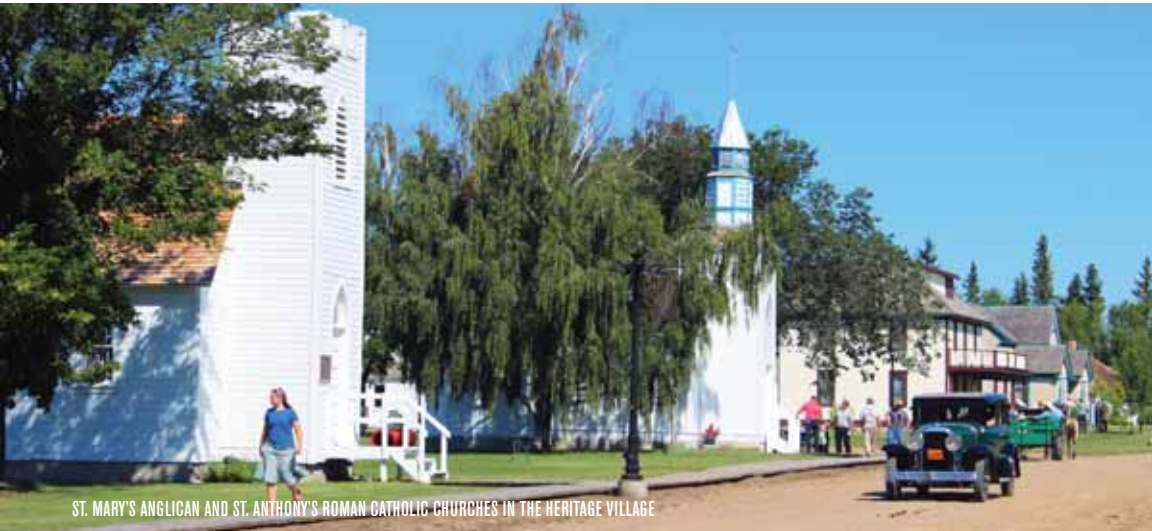
ST. MARY'S ANGLICAN AND ST. ANTHONY'S ROMAN CATHOLIC CHURCHES IN THE HERITAGE VILLAGE