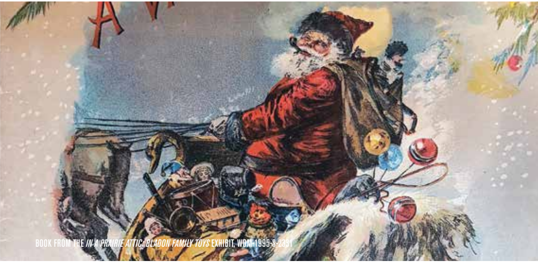
BOOK FROM THE IN A PRAIRIE ATTIC, BLADON FAMILY TOYS EXHIBIT, WDM-1995-S-2351