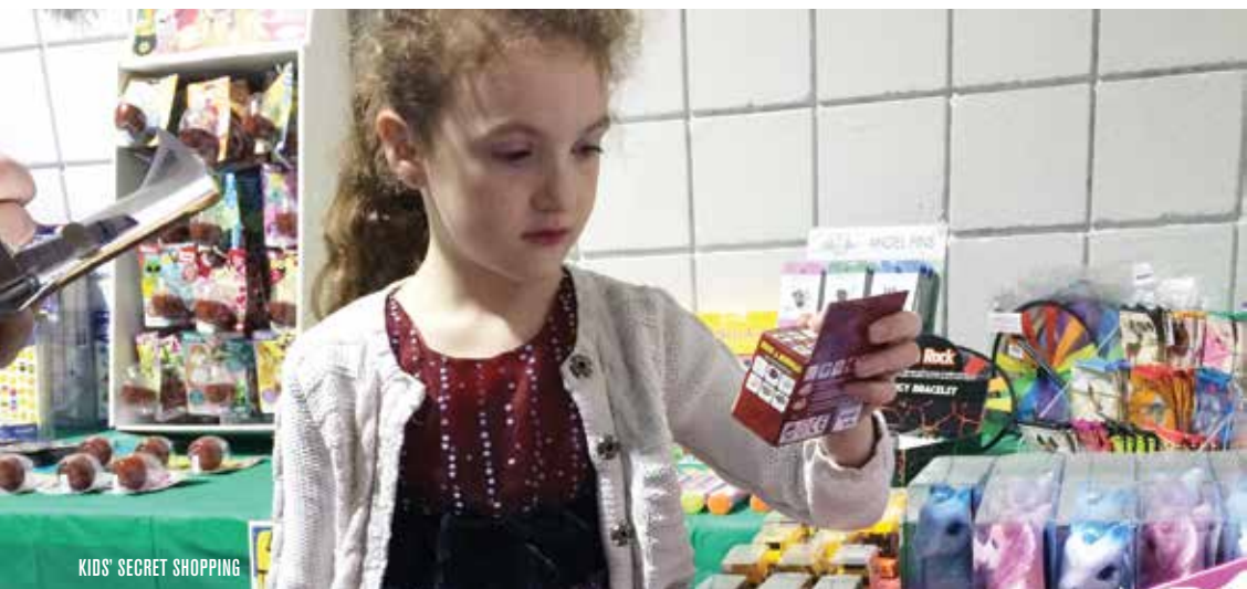
KIDS' SECRET SHOPPING