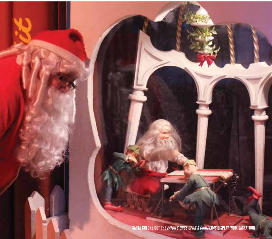
SANTA CHECKS OUT THE EATON'S ONCE UPON A CHRISTMAS DISPLAY, WDM SASKATOON

NEWSLETTER OF THE WESTERN DEVELOPMENT MUSEUM