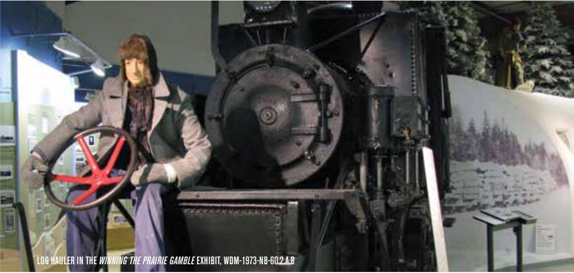
LOG HAULER IN THE WINNING THE PRAIRIE GAMBLE EXHIBIT, WDM-1973-NB-60.2.A.B