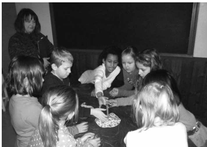
In 2013, students learned about past traditions while taking part in the Celebrate Christmas Past program at the Yorkton WDM.