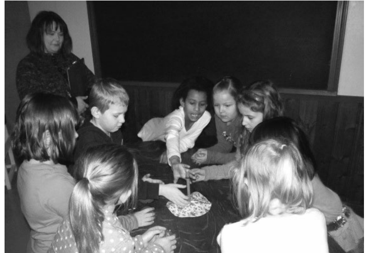
In 2013, students learned about past traditions while taking part in the Celebrate Christmas Past program at the Yorkton WDM.