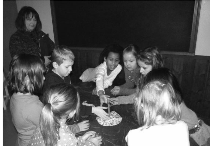
In 2013, students learned about past traditions while taking part in the Celebrate Christmas Past program at the Yorkton WDM.