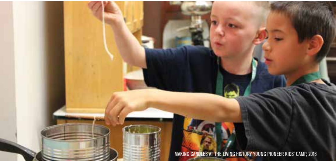
MAKING CANDLES AT THE LIVING HISTORY YOUNG PIONEER KIDS' CAMP, 2016