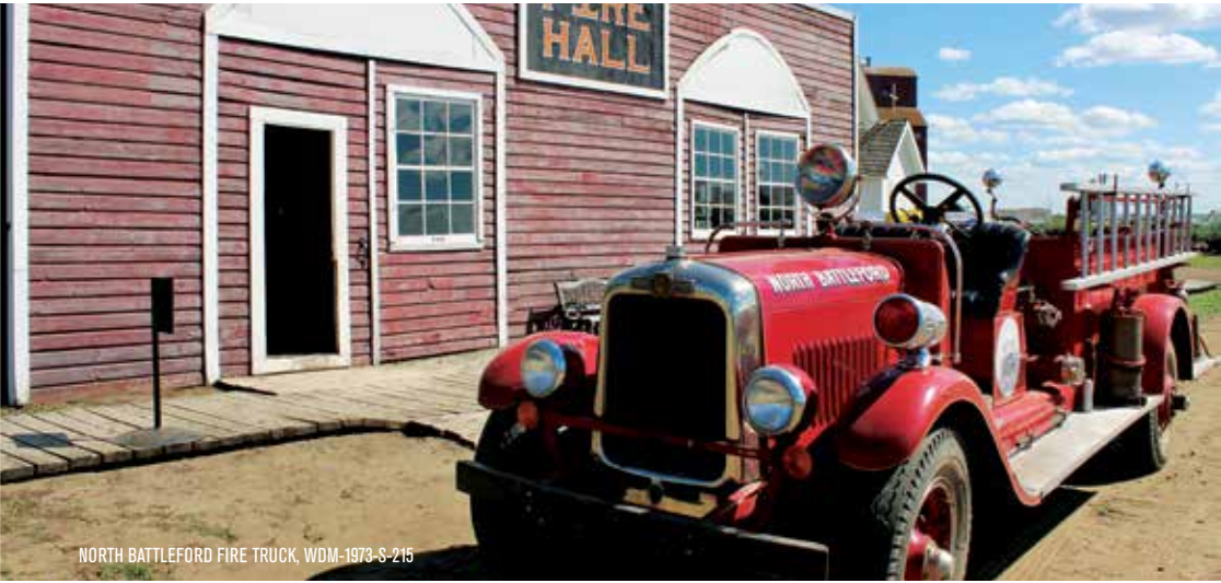
NORTH BATTLEFORD FIRE TRUCK, WDM-1973-S-215