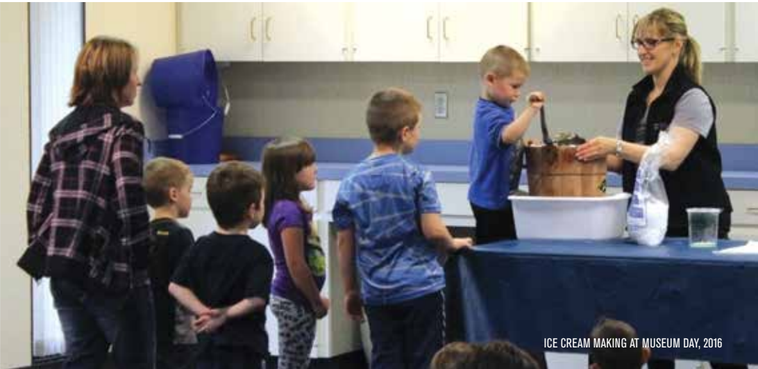
ICE CREAM MAKING AT MUSEUM DAY, 2016