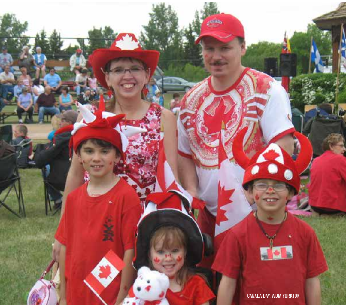
CANADA DAY, WDM YORKTON

NEWSLETTER OF THE WESTERN DEVELOPMENT MUSEUM