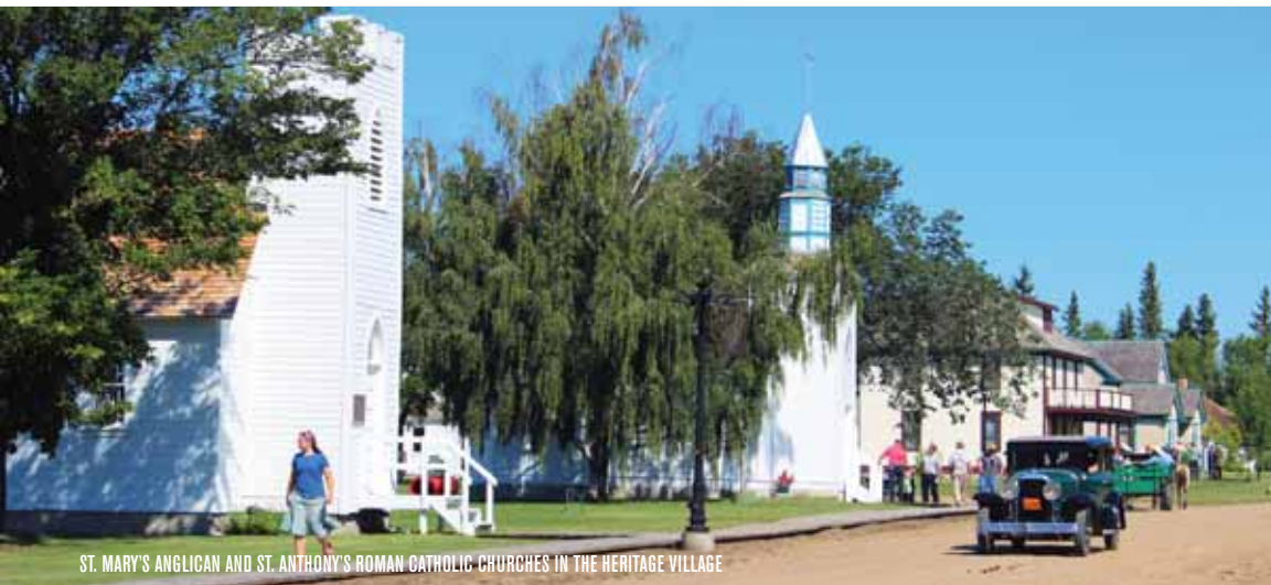
ST. MARY'S ANGLICAN AND ST. ANTHONY'S ROMAN CATHOLIC CHURCHES IN THE HERITAGE VILLAGE