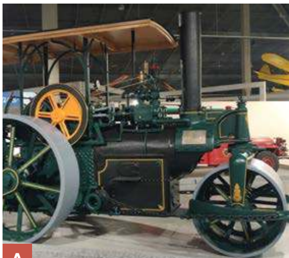
A WDM Moose Jaw – Waterous Road Roller WDM Permanent Exhibit