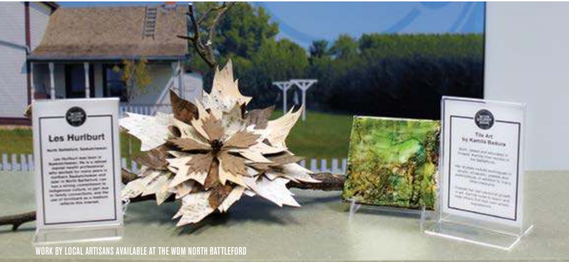
WORK BY LOCAL ARTISANS AVAILABLE AT THE WDM NORTH BATTLEFORD