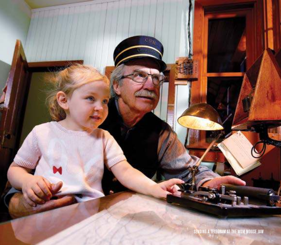
SENDING A TELEGRAM AT THE WDM MOOSE JAW

NEWSLETTER OF THE WESTERN DEVELOPMENT MUSEUM