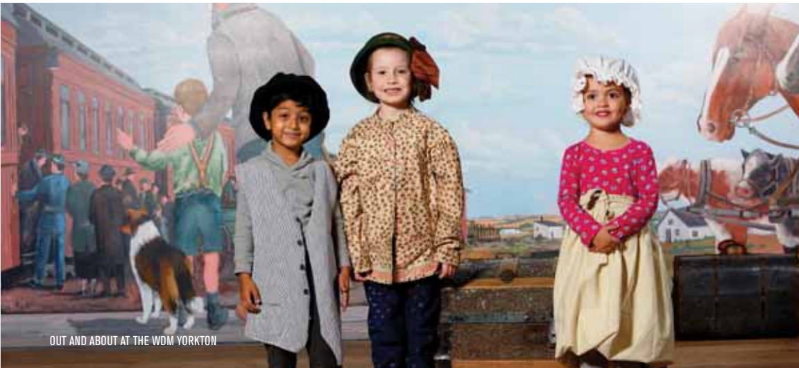
OUT AND ABOUT AT THE WDM YORKTON