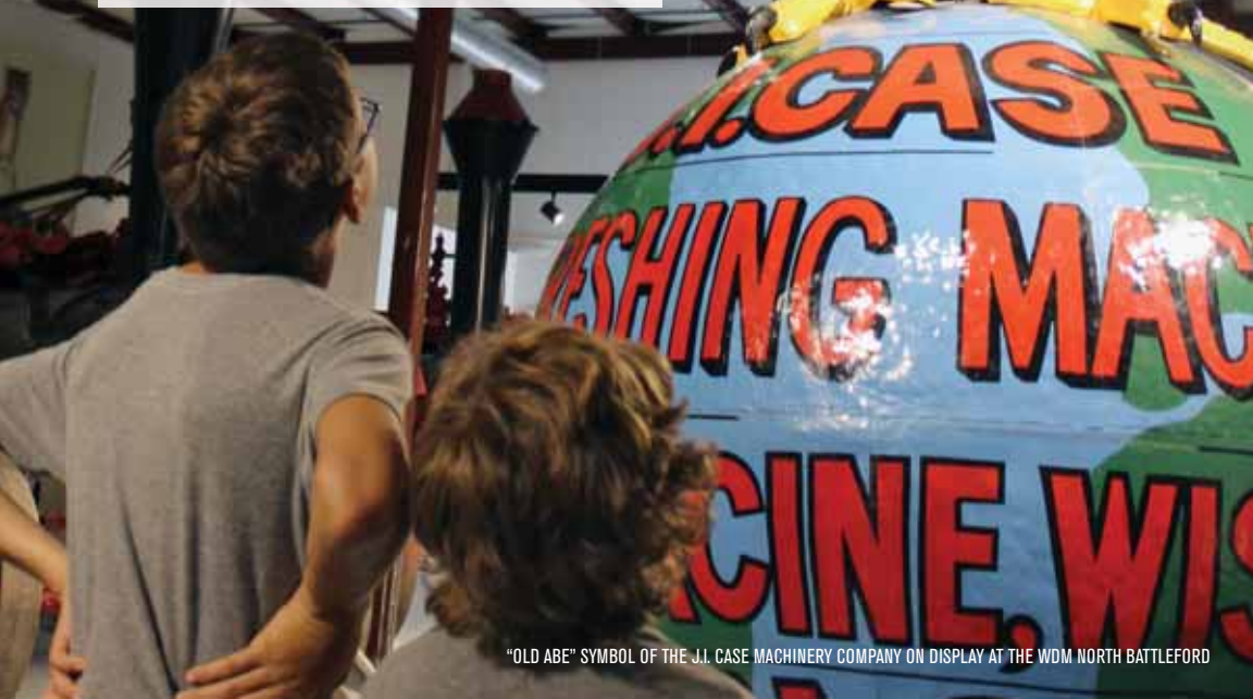
"OLD ABE" SYMBOL OF THE J.I. CASE MACHINERY COMPANY ON DISPLAY AT THE WDM NORTH BATTLEFORD