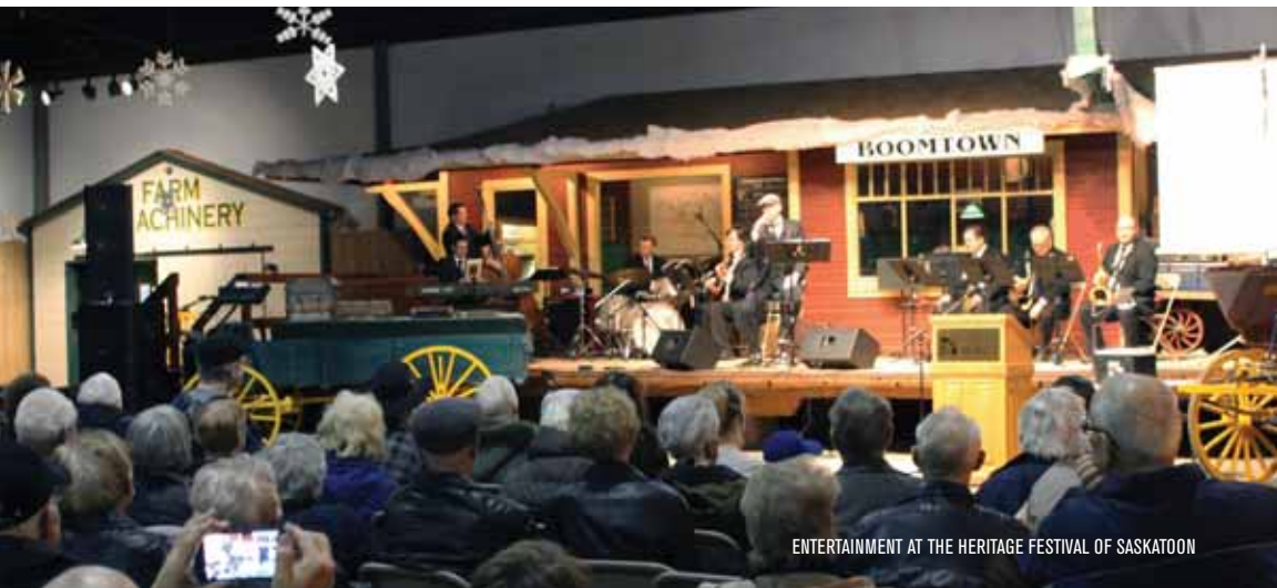
ENTERTAINMENT AT THE HERITAGE FESTIVAL OF SASKATOON