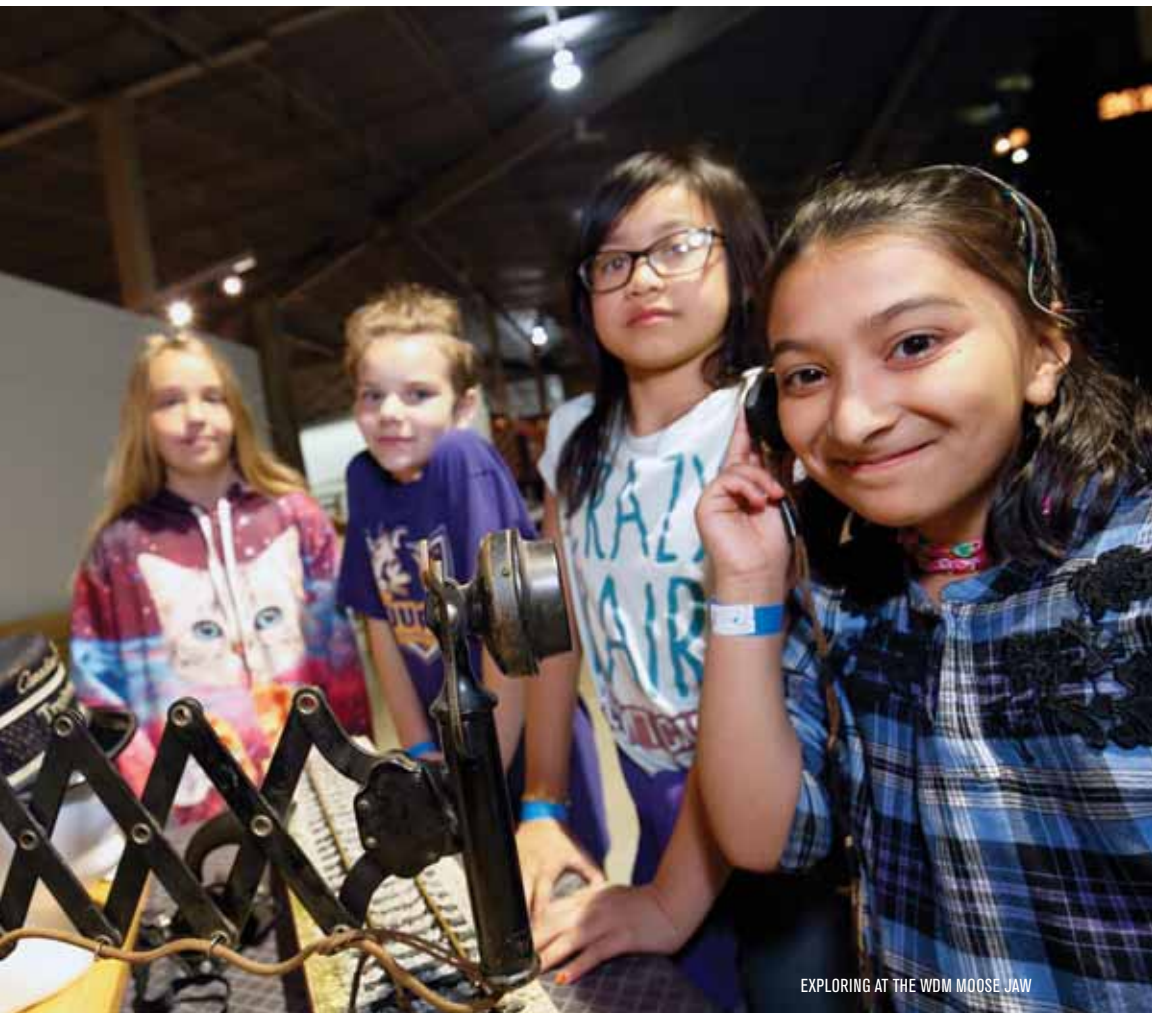
EXPLORING AT THE WDM MOOSE JAW

NEWSLETTER OF THE WESTERN DEVELOPMENT MUSEUM