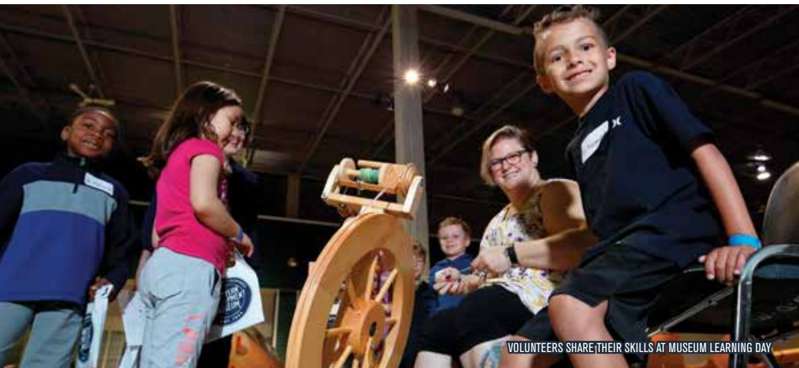
VOLUNTEERS SHARE THEIR SKILLS AT MUSEUM LEARNING DAY