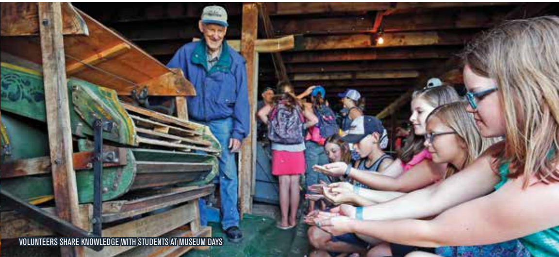
VOLUNTEERS SHARE KNOWLEDGE WITH STUDENTS AT MUSEUM DAYS