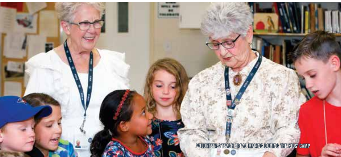
VOLUNTEERS TEACH BREAD MAKING DURING THE KIDS' CAMP