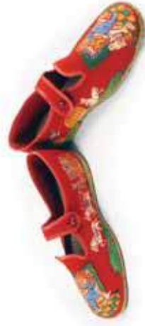
FELT SLIPPERS WITH PAINTING OF CINDERELLA, NO DATE WDM COLLECTION, WDM-1976-S-642