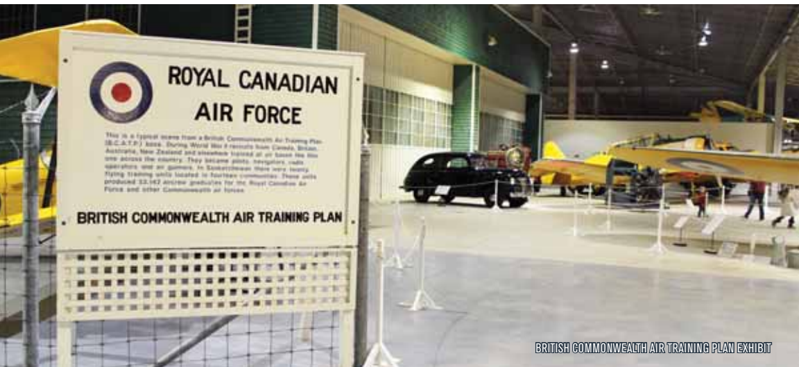
BRITISH COMMONWEALTH AIR TRAINING PLAN EXHIBIT