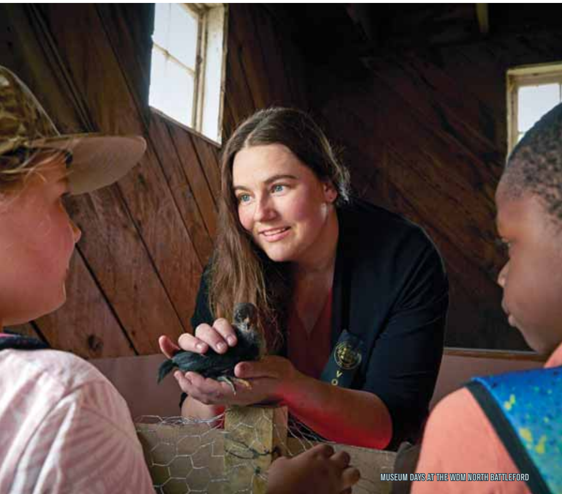
MUSEUM DAYS AT THE WDM NORTH BATTLEFORD

NEWSLETTER OF THE WESTERN DEVELOPMENT MUSEUM