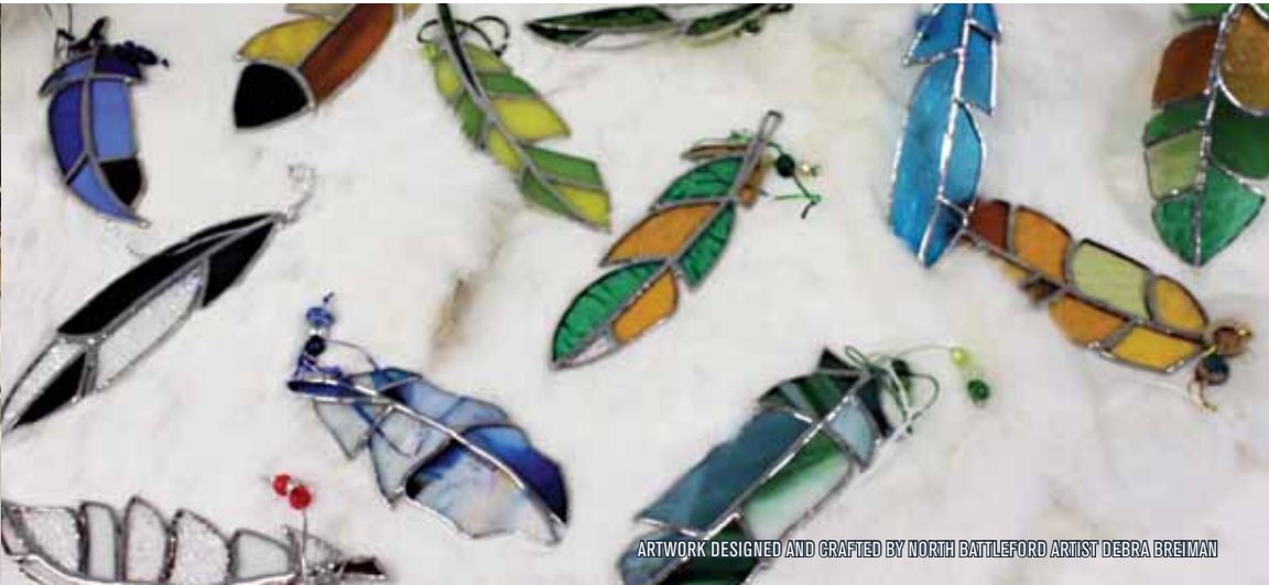
ARTWORK DESIGNED AND CRAFTED BY NORTH BATTLEFORD ARTIST DEBRA BREIMAN