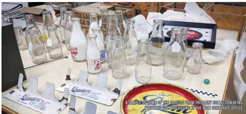
A SAMPLE OF SOME OF THE OBJECTS FROM THE DAIRY COLLECTION BEING PREPARED FOR PROCESSING AT THE WDM CORPORATE OFFICE

These objects are a throwback to the days of home milk delivery and highlight a change in how people interact with and obtain their food. Today, home milk delivery is a rarity, whereas just a few decades ago it was the most common way for city dwellers to get their dairy!