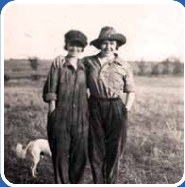
TWO UNKNOWN FRIENDS PAUSING FOR A PHOTOGRAPH

Find us on Facebook at facebook.com/wdm.museum