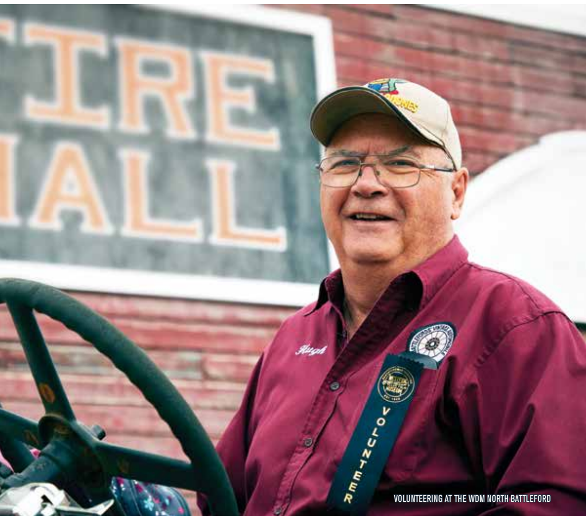
VOLUNTEERING AT THE WDM NORTH BATTLEFORD

NEWSLETTER OF THE WESTERN DEVELOPMENT MUSEUM