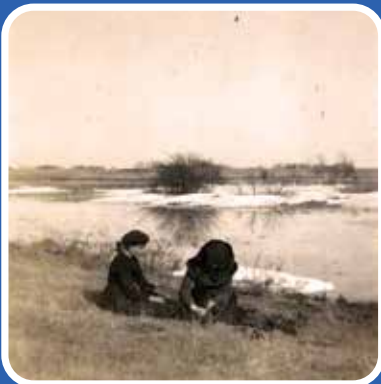
THIS PHOTO SHOWS THE SIMPLE KINDNESS OF ONE CHILD HELPING ANOTHER WITH A BOOT OR SHOE. TAKEN NEAR THE BARTON FARM NEAR FLORAL, SK

DATE: BEFORE 1940.