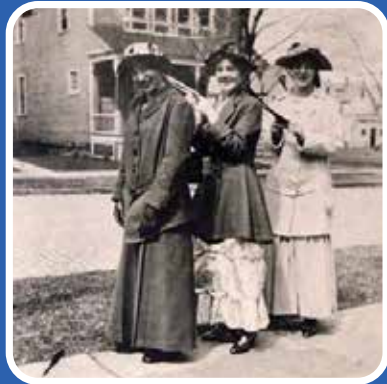
THIS PHOTO FROM C.1918 SHOWS THREE UNKNOWN YOUNG WOMEN HAVING FUN, LAUGHING AND HOLDING EACH OTHER'S HAT RIBBONS

DATE: 1931.