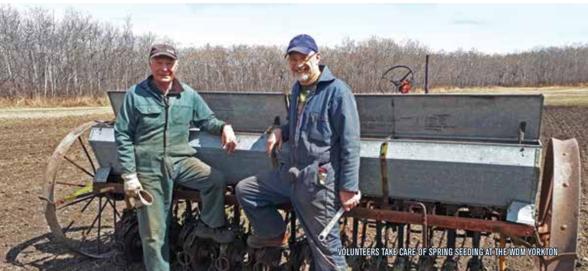
VOLUNTEERS TAKE CARE OF SPRING SEEDING AT THE WDM YORKTON