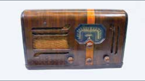
ADDISON TABLE RADIO C. 1932 WDM-2003-S-323

The first radio signal was transmitted near the end of the 19th Century. After that, technology and understanding of radio waves advanced to a point where commercial radios became available in the early 20th Century. The popularity of radios as a form of entertainment grew rapidly from the 1920s until television took over in the mid 20th Century.