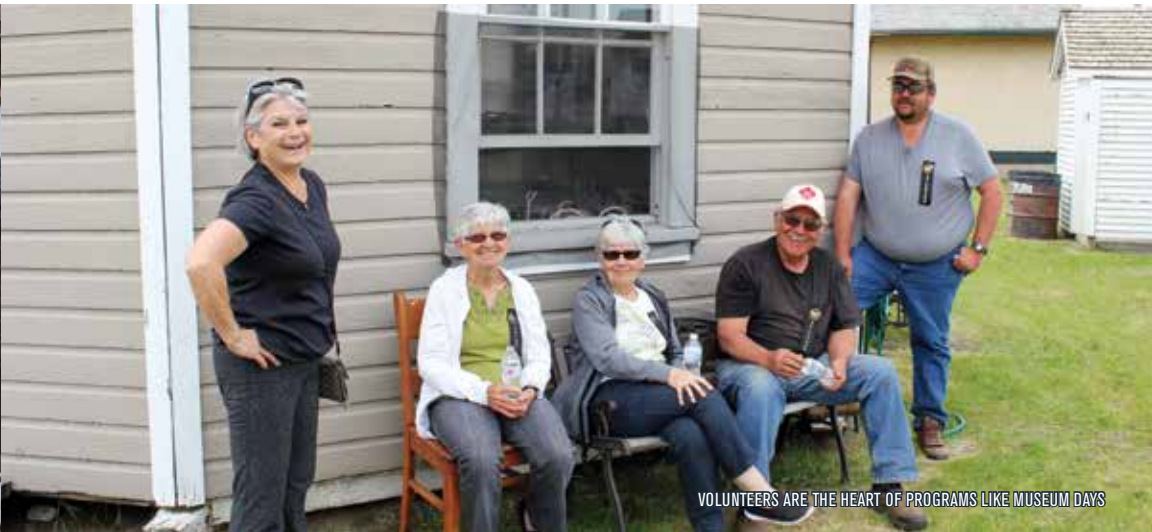
VOLUNTEERS ARE THE HEART OF PROGRAMS LIKE MUSEUM DAYS