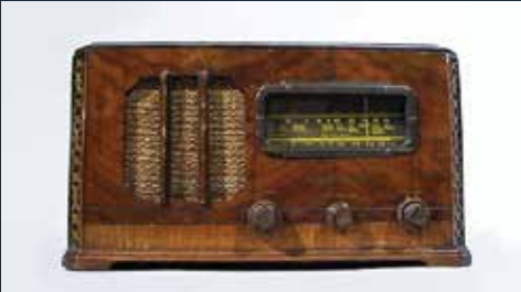
STROMBERG-CARLSON ELECTRIC RADIO C. 1940 WDM-1973-S-5048