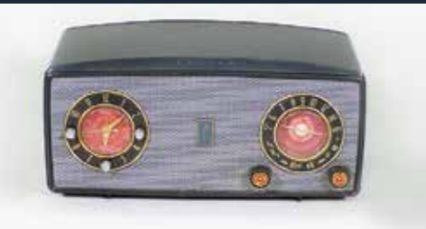
PHILCO MANTEL RADIO, C. 1955 WDM-2002-S-431