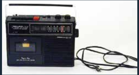
REALISTIC BRAND RADIO/CASSETTE PLAYER, C. 1970 WDM-2009-S-698