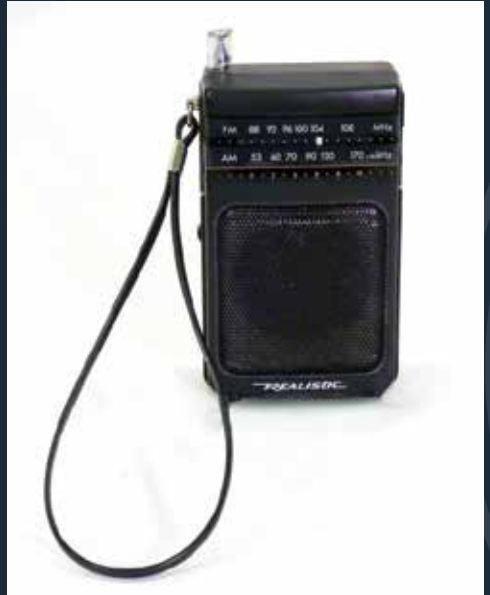
REALISTIC BRAND TRANSISTOR RADIO, 1993 WDM-2009-S-8