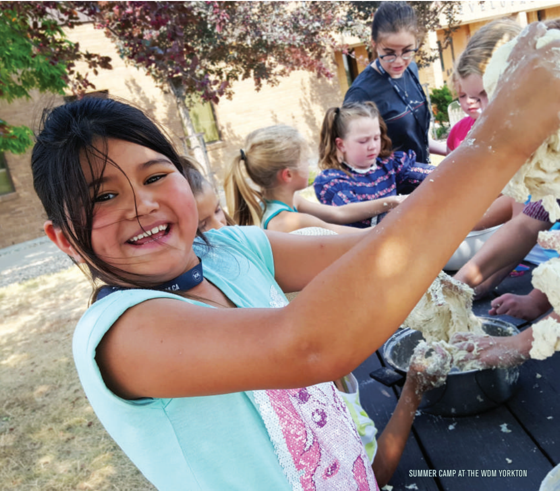
SUMMER CAMP AT THE WDM YORKTON

NEWSLETTER OF THE WESTERN DEVELOPMENT MUSEUM