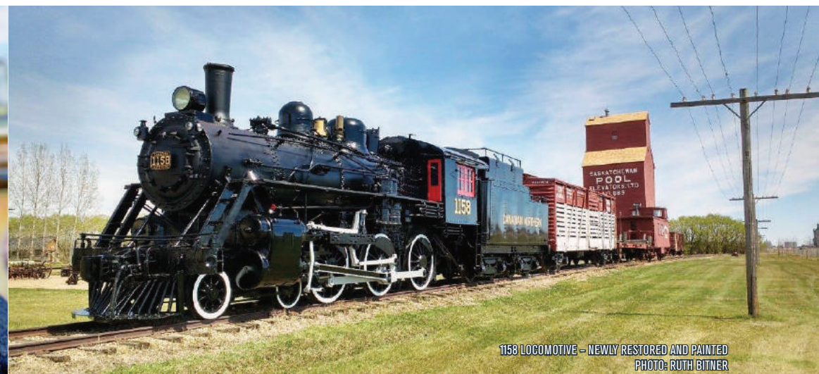
1158 LOCOMOTIVE – NEWLY RESTORED AND PAINTED