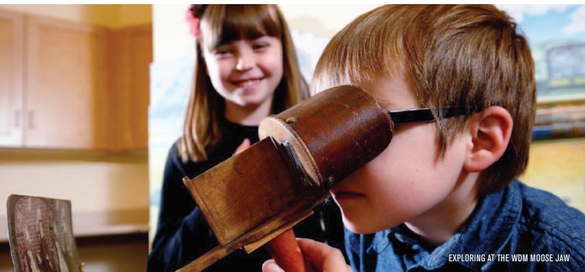
EXPLORING AT THE WDM MOOSE JAW