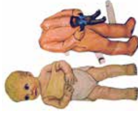
DIONNE QUINTUPLETS PAPER DOLL, C. 1930S WDM COLLECTION, WDM-2017-S-4