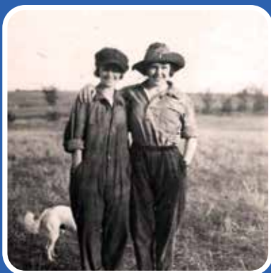
TWO UNKNOWN FRIENDS PAUSING FOR A PHOTOGRAPH

Find us on Facebook at facebook.com/wdm.museum