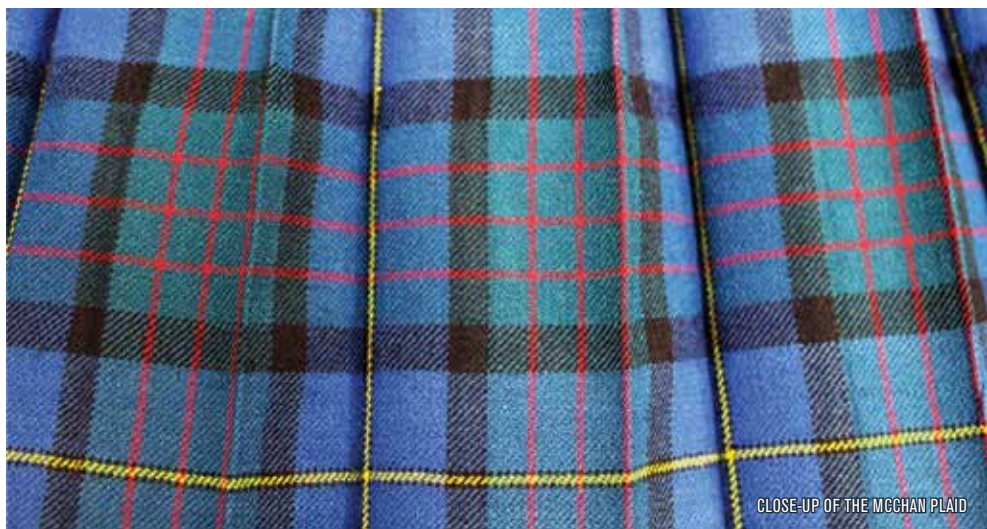
CLOSE-UP OF THE MCCHAN PLAID