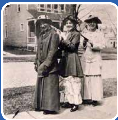
THIS PHOTO FROM C.1918 SHOWS THREE UNKNOWN YOUNG WOMEN HAVING FUN, LAUGHING AND HOLDING EACH OTHER'S HAT RIBBONS

DATE: 1931. WDM GEORGE SHEPHERD LIBRARY, TACKABERRY COLLECTION