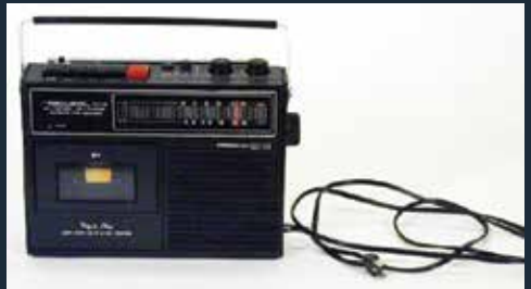
REALISTIC BRAND RADIO/CASSETTE PLAYER, C. 1970 WDM-2009-S-698