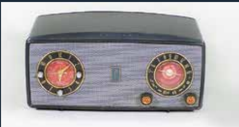
PHILCO MANTEL RADIO, C. 1955 WDM-2002-S-431