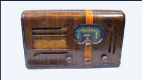
ADDISON TABLE RADIO C. 1932 WDM-2003-S-323

The first radio signal was transmitted near the end of the 19th Century. After that, technology and understanding of radio waves advanced to a point where commercial radios became available in the early 20th Century. The popularity of radios as a form of entertainment grew rapidly from the 1920s until television took over in the mid 20th Century.